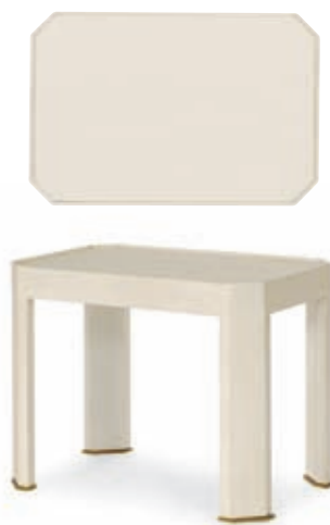
Shown in Plantation