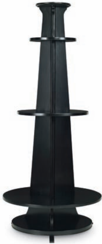
Shown in Jet