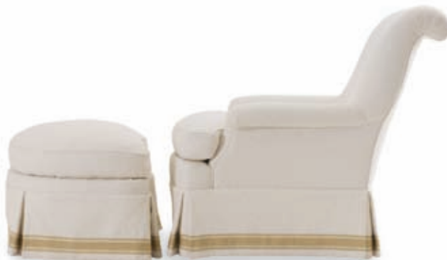
i2-11-1023 | Fayetteville Chair

w 30 d 37.5 h 33 w 20 d 25.5 h 13 seat height 19 arm height 20