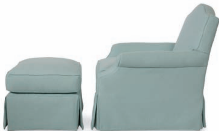
i2-11-1026 | Mobile Arm Chair

w 36 d 39 h 38 w 23.5 d 25.5 h 18.5 seat height 20 arm height 23