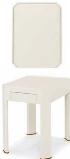
Shown in Plantation