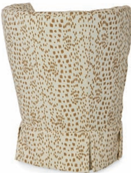
i2-11-1045SK Biloxi Skirted Tub Chair w 31 d 30 h 39.5 w 20 d 21.5 h 19.5 seat height 20 arm height 39.5