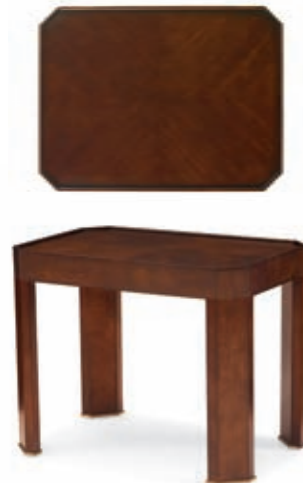
Shown in Cognac