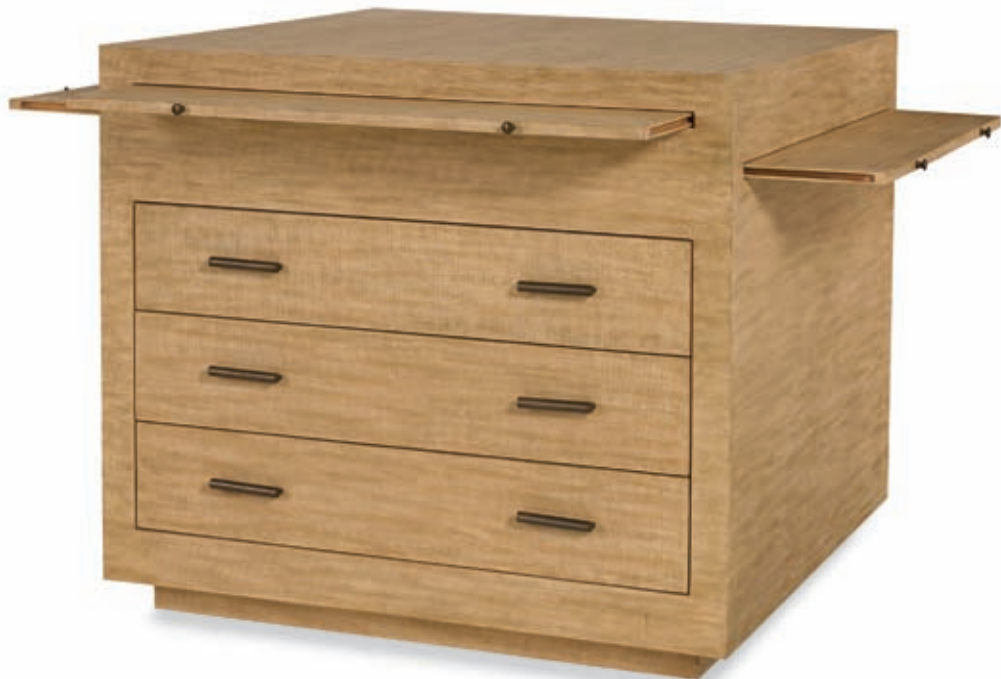
i2E-636 | Tupelo Scrapbooking Table