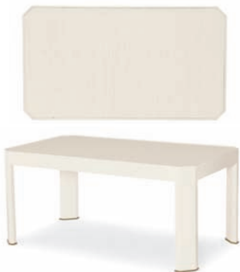
Shown in Plantation