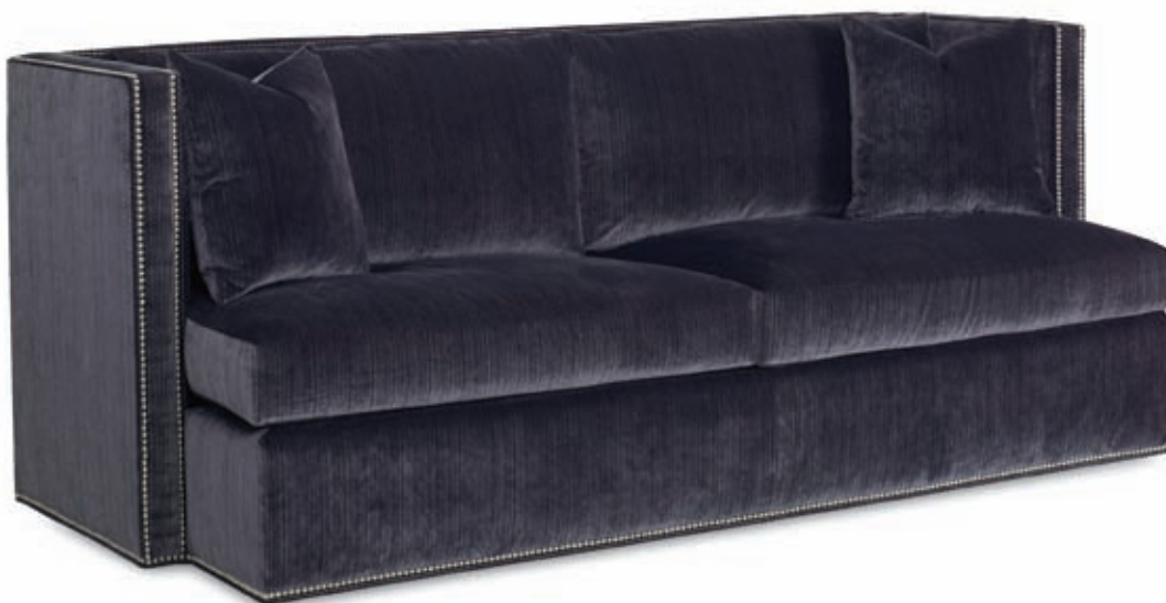
i2-22-1040 | Shreveport Sofa