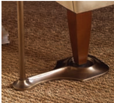
i29-612 | Fairfax Drink Table