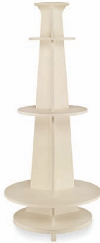
Shown in Plantation