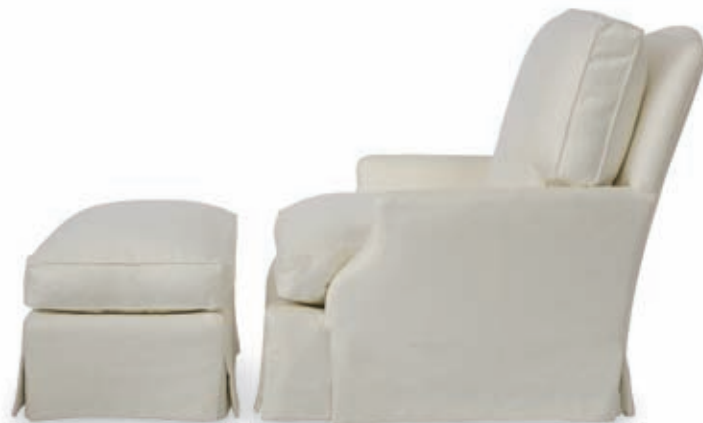
i2-11-1025 | Savannah Arm Chair

w 32.5 d 40.5 h 37 w 25.5 d 23 h 17 seat height 20 arm height 23