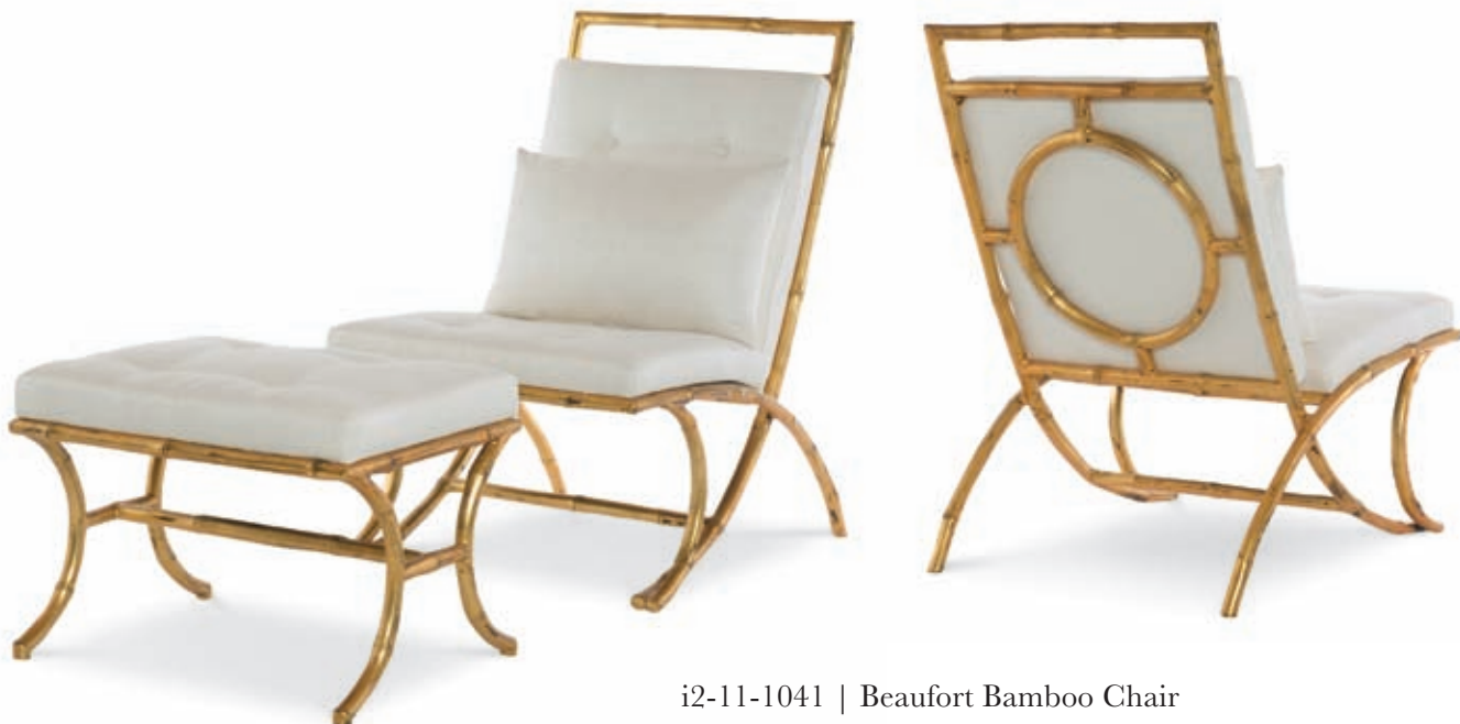
i2-11-1041 | Beaufort Bamboo Chair