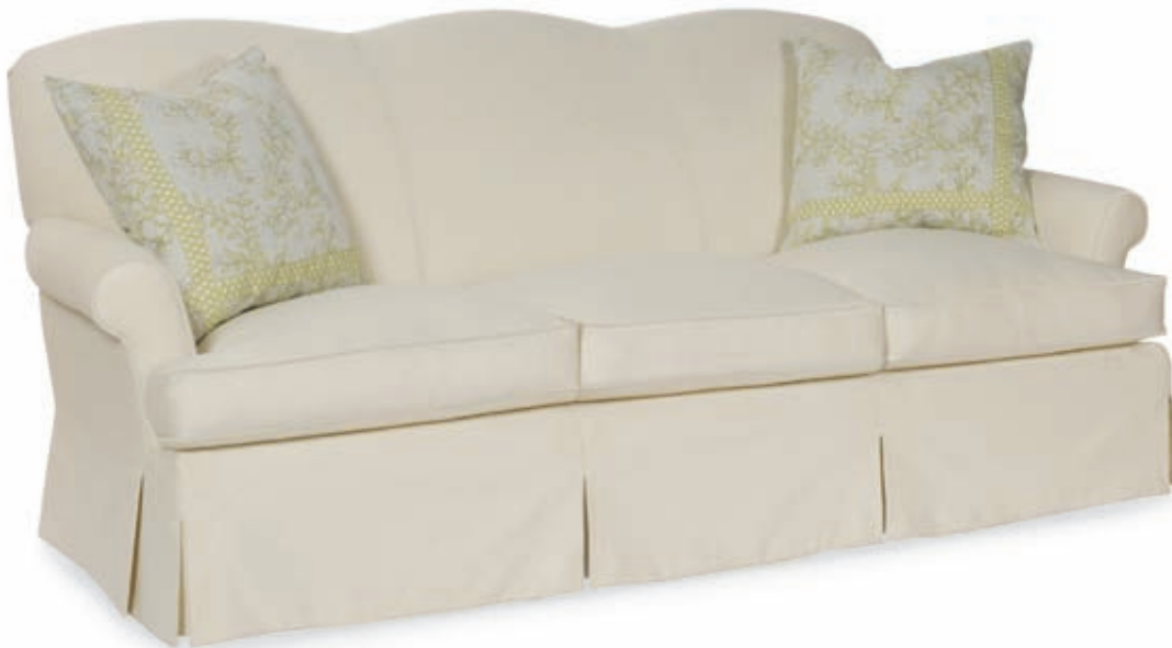
i2-22-1020 | Natchez Sofa