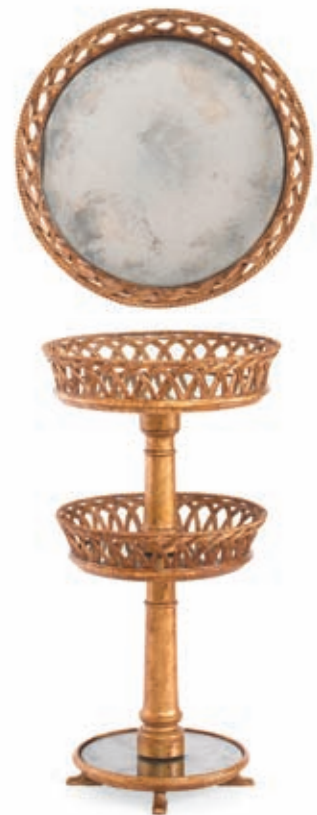
i2D-614 | Memphis Side Table