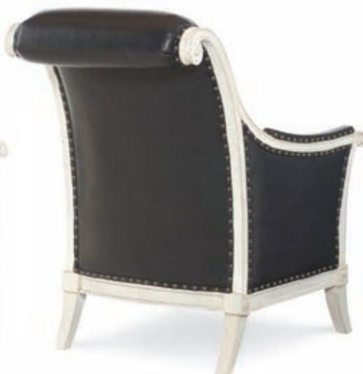
i2-3572 Carlisle Chair w 26 d 34 h 35.5 w 21 d 21 h 16.5 seat height 19 arm height 22.5