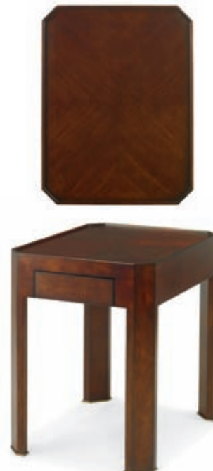
Shown in Cognac