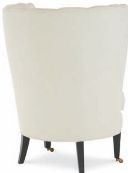
i2-11-1045 Biloxi Slipper Tub Chair w 31 d 30 h 39.5 w 20 d 21.5 h 19.5 seat height 20 arm height 39.5