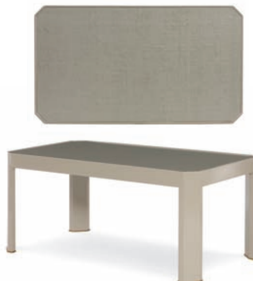
Shown in Dove