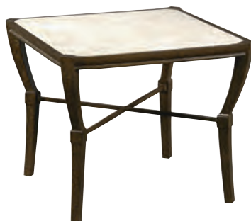
D12-85-1 Side Table Andalusia Collection W 24 D 24 H 20 Powder Coated Aluminum Frame finish Cordoba

Custom frame finishes available D12-83-9