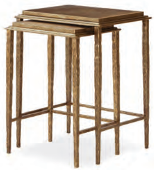
D89-5152-BR Nesting Table (Set of 2) Leisure Complements W 20 D 16 H 26 Antique Bronze Available only as shown