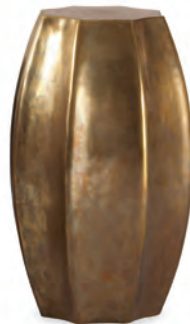
D89-5036-AB 16" Chairside Table Leisure Complements W 16 D 16 H 27 Antique Brass Available only as shown