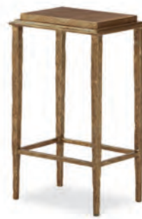
D89-5153-AB Chairside Table Leisure Complements W 13.5 D 10 H 23 Antique Bronze Available only as shown