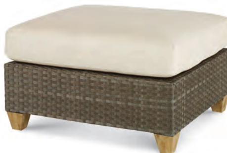
D34-31 Ottoman Dunes Collection W 33 D 30.5 H 19 Seat H 19 All Weather Resin Frame finish Stone Brown