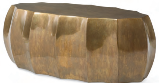
D89-5475-AB Cocktail Table Leisure Complements W 47 D 26 H 19.5 Antique Brass Available only as shown