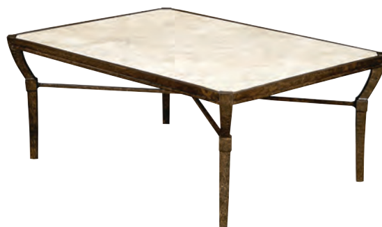
D12-86-1 Cocktail Table Andalusia Collection W 42 D 30 H 17 Powder Coated Aluminum Frame finish Cordoba

Custom frame finishes available D12-85-9