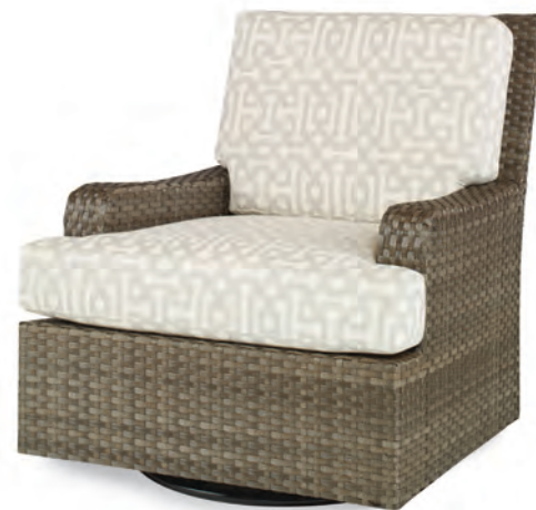
D34-16 Swivel Lounge Chair Dunes Collection W 33 D 38 H 37 Inside: W 24.5 D 24.5 H 18 Seat H 19 | Arm H 23 All Weather Resin Frame finish Stone Brown