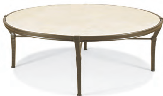
D12-88-1 50" Round Cocktail Table Andalusia Collection W 50 D 50 H 17 Powder Coated Aluminum Frame finish Cordoba

Custom frame finishes available D12-86-9