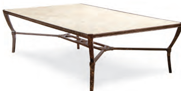
D12-89-1 72" Rectangular Cocktail Table Andalusia Collection W 72 D 44 H 17 Powder Coated Aluminum Frame finish Cordoba

Custom frame finishes available D12-88-9