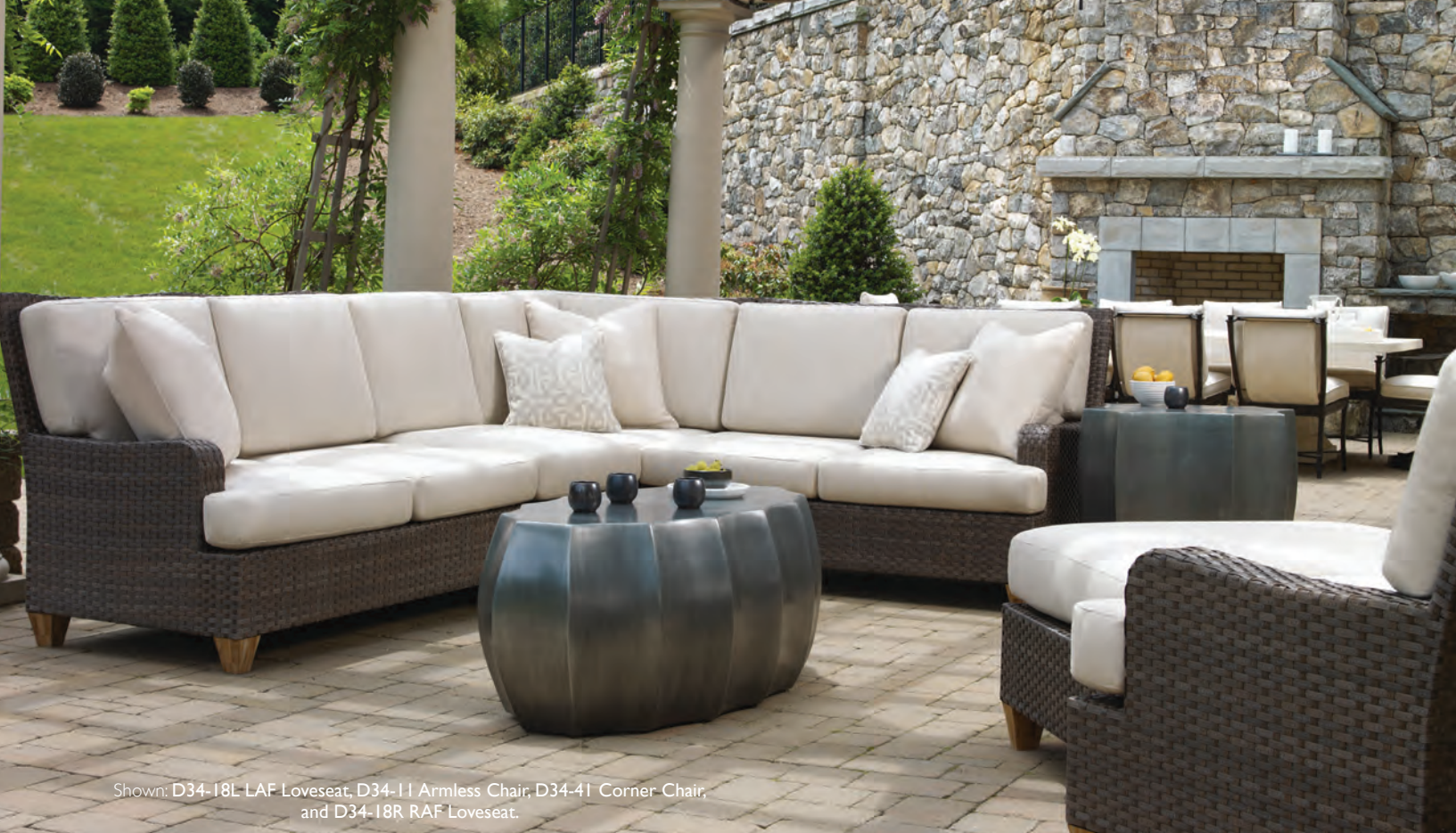
Shown: D34-18L LAF Loveseat, D34-11 Armless Chair, D34-41 Corner Chair, and D34-18R RAF Loveseat.