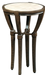
D12-83-1 Occasional Table Andalusia Collection W 14 D 14 H 23 Powder Coated Aluminum Frame finish Cordoba

Custom frame finishes available D12-83-9