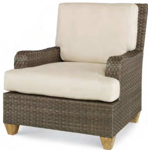
D34-12 Lounge Chair Dunes Collection W 33 D 38 H 37 Inside: W 24.5 D 24.5 H 18 Seat H 19 | Arm H 23 All Weather Resin Frame finish Stone Brown