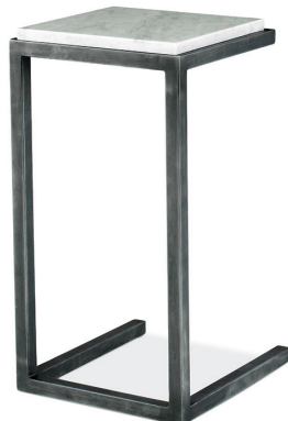
D89-5232-AP 12.75" Rectangular Side Table W 12.75 D 14.75 H 24.25 Frame finish Antique Pewter Carrara Stone top