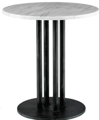
D89-3100-AP 22" Round Occasional Table W 22 D 22 H 24 Frame finish Antique Pewter Carrara Stone top