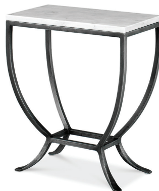
D89-5226-AP 18" Rectangular Side Table W 18 D 10 H 22 Frame finish Antique Pewter Carrara Stone top