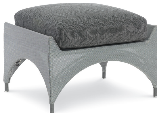
D32-31-9 Ottoman W 26.5 D 21 H 16.5 Inside: W 21 D 21 Seat H 16.5 Frame finish Titanium