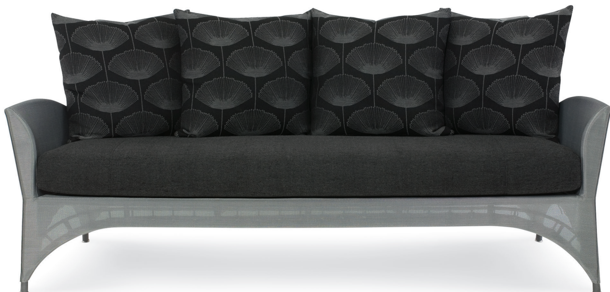
D32-22-9 Sofa W 80 D 31.5 H 36 Inside: W 72 D 19.5 H 17.5 Seat H 18.5 H | Arm H 26 Frame finish Titanium