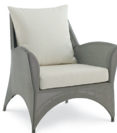
Shown in 17000-11