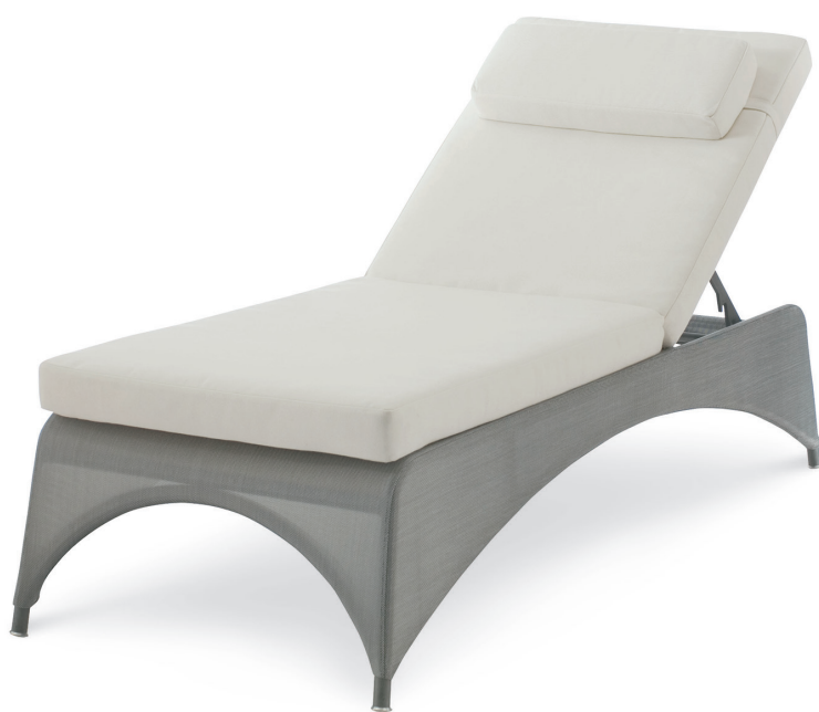
D32-70-9 Chaise Lounge (shown left) D32-70-9 Chaise Lounge (shown right) W 28 D 68 H 39.5 Inside: W 28 D 38.5 H 22 Seat H 17.5 Frame finish Titanium