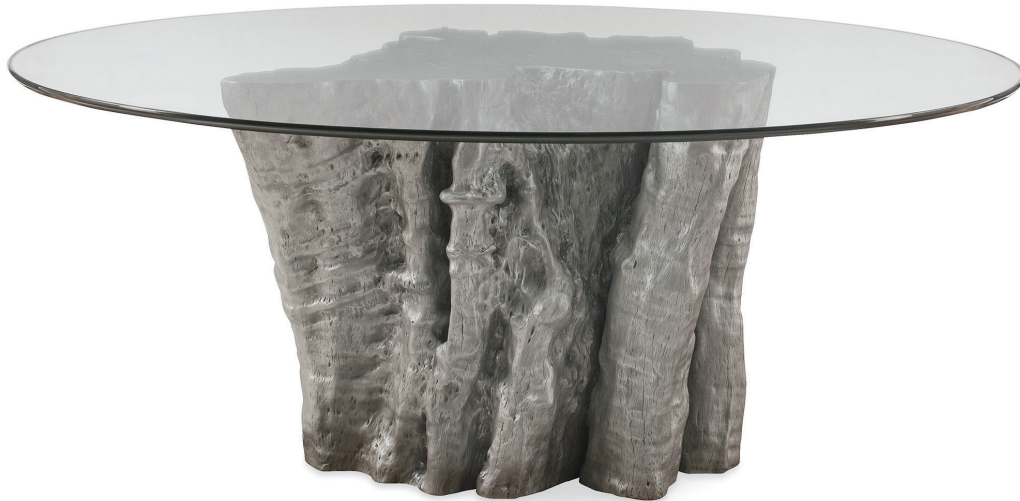
D89-5498-AZ Dining Table Base W 43.5 D 37.5 H 30 Finish Antique Zinc Available only as shown Glass not included