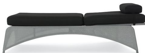
Shown fully reclined | D 71 | Seat H 17.5