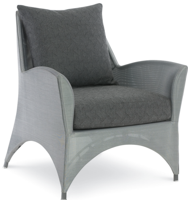
D32-12-9 Lounge Chair W 32 D 31.5 H 36 Inside: W 24 D 19.5 H 17.5 Seat H 18.5 | Arm H 26 Frame finish Titanium