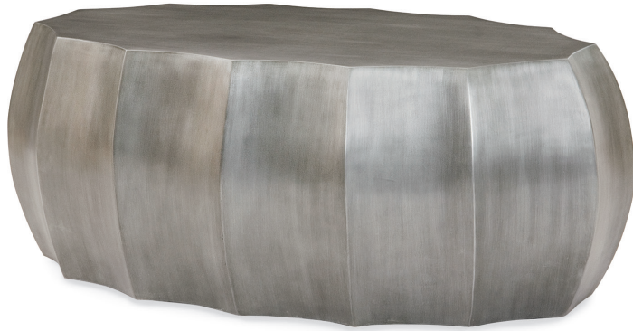
D89-5500-AZ Cocktail Table W 47 D 26 H 19.5 Finish Antique Zinc Available only as shown