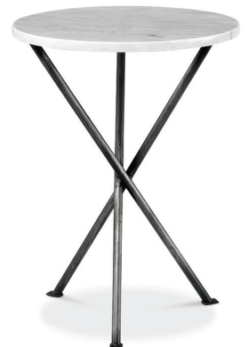
D89-5210-AP 18" Round Occasional Table W 18 D 18 H 24 Frame finish Antique Pewter Carrara Stone top