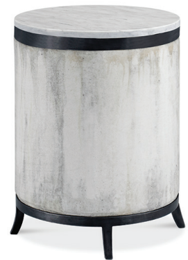
D89-3101-AW 18.25" Round Side Table W 18.25 D 18.25 H 22 Frame finish Antique Pewter Cast GRC with Carrara Stone top