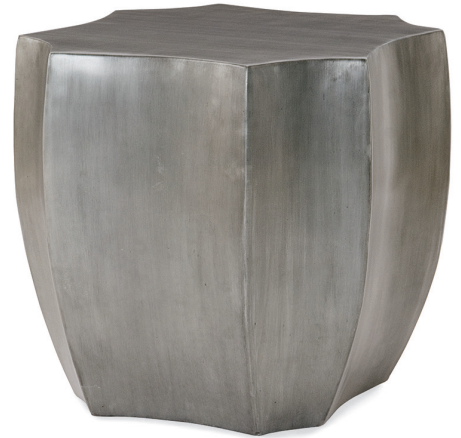
D89-5501-AZ Lamp Table W 25 D 25 H 25.5 Finish Antique Zinc Available only as shown