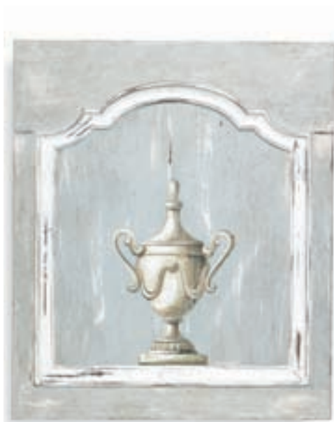
SA6066 Wall Painting

Each of these striking wall paintings is handpainted onto select Asian hardwoods with an antique grey finish and features a different urn motif. Use individually or in groupings to bring classical elegance to any setting.