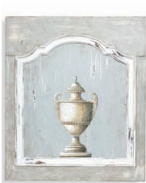
SA6064 Wall Painting