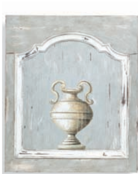
SA6065 Wall Painting