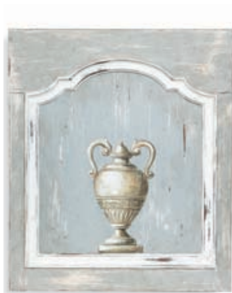
SA6067 Wall Painting